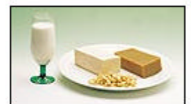
Soy Bean Juice & Tofu

• The Angel's gear system is the first extractor gearing system to be awarded U.S. patent rights and is the winner of 3 international awards.