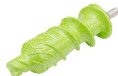
Latest two step 'propeller' auger

The Vital Max has a fully adjustable juicing pressure mechanism at the front of the machine which allows you to adjust pressure inside the machine while you are juicing.